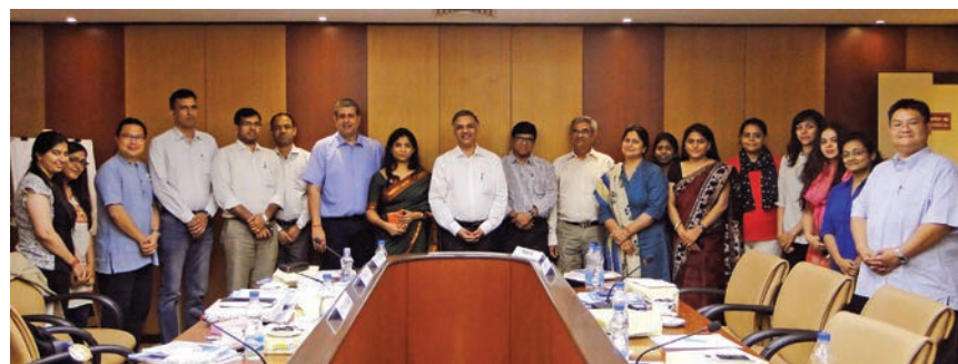
Members of the Chulalongkorn University (CU), Bangkok, with RIS faculty-members.