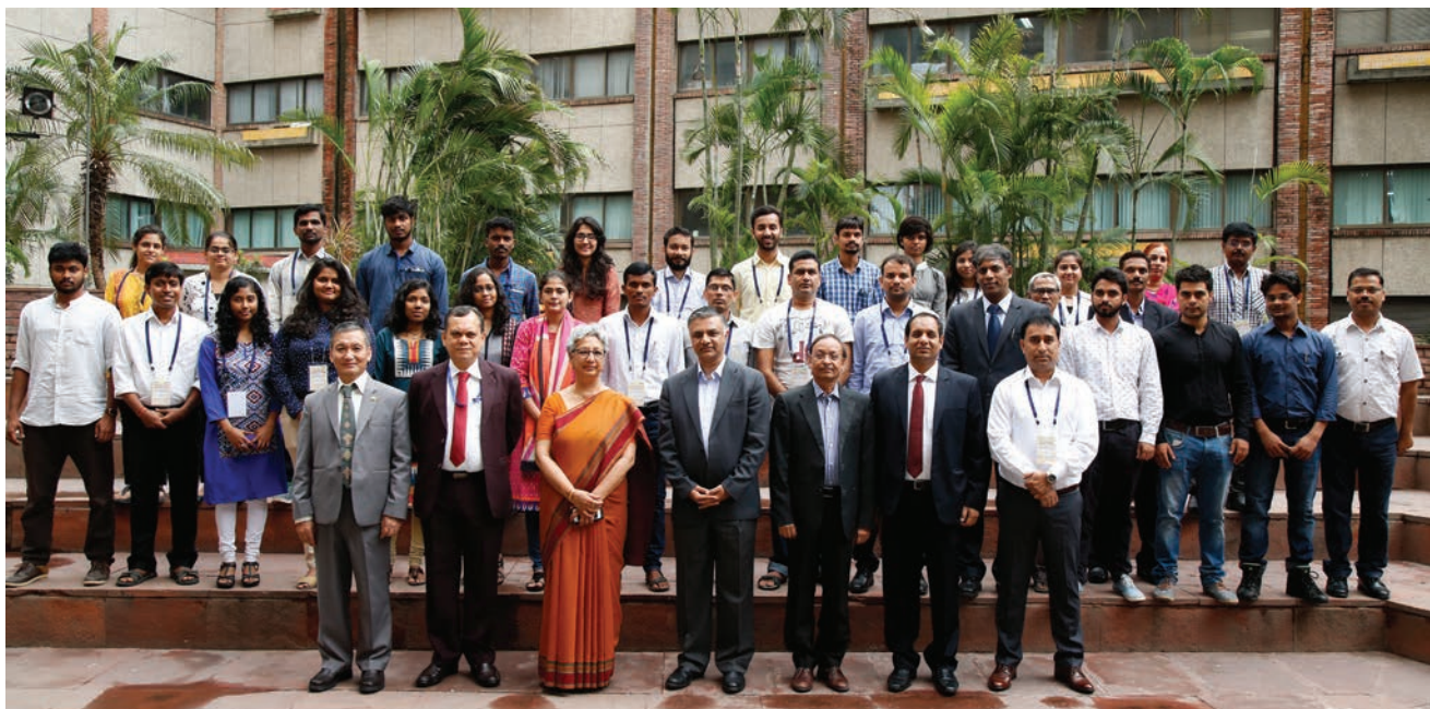
RIS-EXIM Bank Summer School participants with Commerce Secretary and RIS faculty-members

and Information on International Trade; Module 3 : Tools and Techniques in Trade Analysis; Module 4 : Understanding FTAs and Regional Trading Blocs; Module 5 : Issues of Trade in Technology and Classification Issues; Module 6 : Trade and Development: IPRs and New Issues; and Module 7 : Group Presentations. More than 35 scholars from all-over India participated in the capacity building programme.