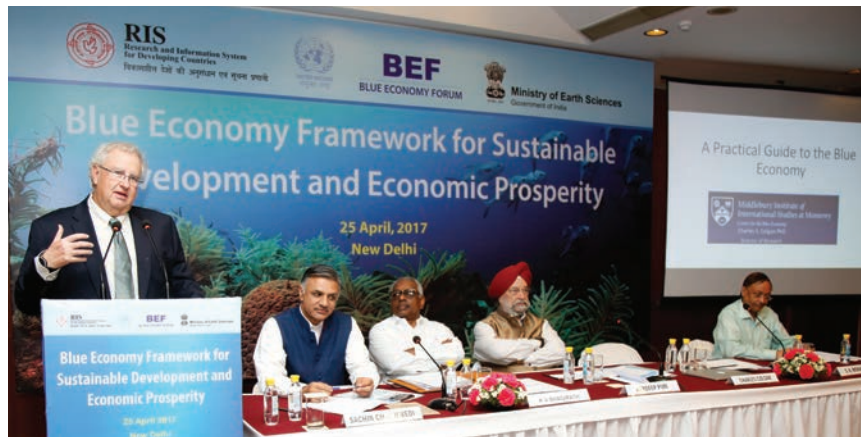
Prof. Charles Colgan, National Ocean Economics Programme (NOEP), USA delivering the Public Lecture on Blue Economy Framework for Sustainable Development and Economic Prosperity

In the recent years, Blue Economy has emerged as a major development paradigm for coastal economies. Ocean sector is a key driver of economic growth for littoral countries, and maintenance of good ocean health is the foremost requirement for sustainable use of ocean resources. In this regard, SDG 14 would certainly complement efficacy of Blue Economy in coastal economies in accomplishing high