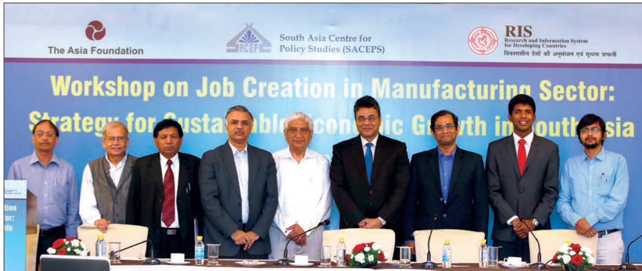
Participants of the conference on Job Creation in Manufacturing Sector as a Strategy for Sustainable Economic Growth in South Asia

The RIS has initiated a major research project in 2016-17 on “Job Creation in Manufacturing Sector as a Strategy for Sustainable Economic Growth in South Asia” with the support from the Asia Foundation as part of the SACEPS Research Programme. The manufacturing sector holds the key for sustainable economic growth in South Asia through gainful, productive and widespread employment generation by bridging existing inequalities. The first workshop under this project