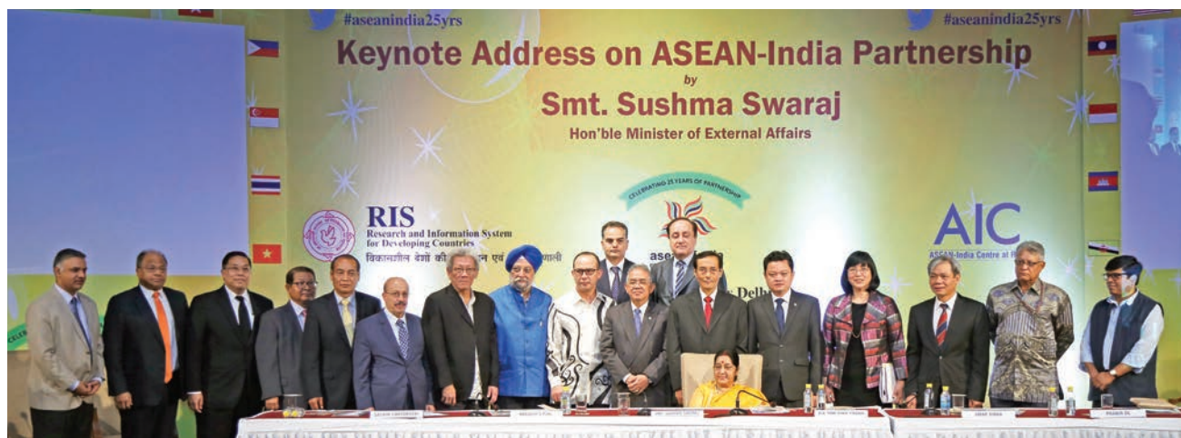
Smt. Sushma Swaraj, Hon'ble External Affairs Minister with other dignitaries on the occasion of the programme on 25 years of ASEAN-India Partnership.

RCEP member-countries cover half the world population, 30 per cent of world GDP and a quarter of world trade. The regional grouping has several countries including China whose economies are among the most export competitive in the world. The negotiations would be a very challenging one for India. India's earlier FTAs or CEPAs with countries in this region have not been models of success in their implementation even as there have been benefits. If RCEP has to be more successful, a great deal of planning and strategising is critical. India has to become more competitive for the concessions it secures to translate into realisable market access. It should also secure sufficient flexibilities to be able to ensure that domestic players have a fair playing field in being able to withstand competition. This paper outlines a possible approach and strategy.