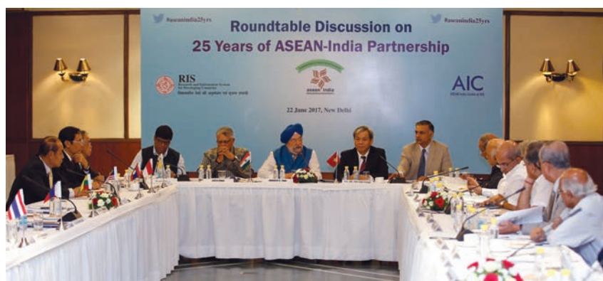
Roundtable Discussion on 25 Years of ASEAN-India Partnership in progress.